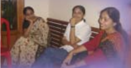
ALL KERALA STATE FIRST LADIES ASSOCIATION GENERAL MEETING....