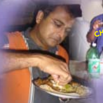
DOCTORS SURGERY- WHERE IS THE STONE???