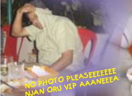
NO PHOTO PLEASEEEEEEE NJAN ORU VIP AAANEEEA