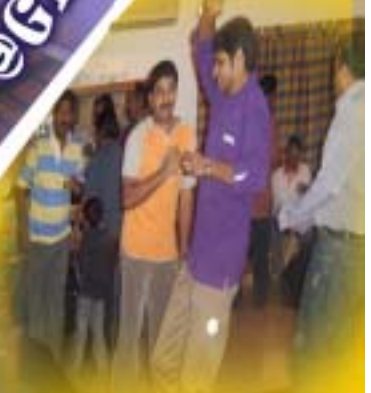
PAMBUKALKUM DANCE CHEYYAM...