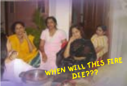
WHEN WILL THIS FIRE DIE???