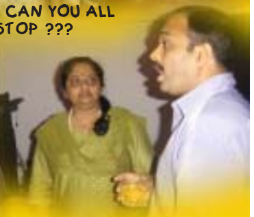
VAYYYYYYYA ADACKADO !!!!