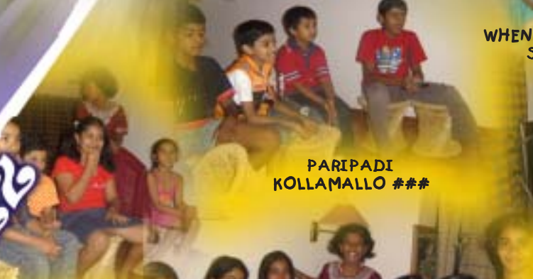
PARIPADI KOLLAMALLO ###